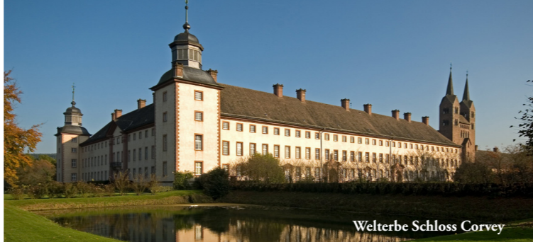
Welterbe Schloss Corvey