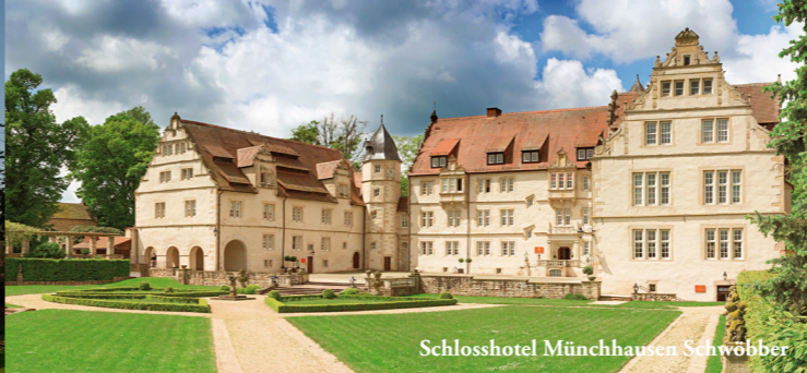
Schlosshotel Münchhausen Schwöbber